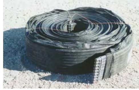
Illustrations: clockwise from left: 1. View of the property before work is begun 2. Roll of the drain core 3. Installing drain core with sand filter 4. View of the property after work is complete